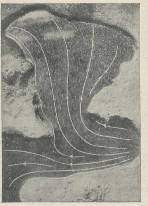
FIG. 2.-Model of Aomori Bay, showing stream lines of lateral oscillation : period 1'63 in model, representing 108 m. in the bay itself.

motion. The period of this oscillation in the model was 4'45 seconds; the factor, corresponding to the scale adopted, being 4090, this represents a period of