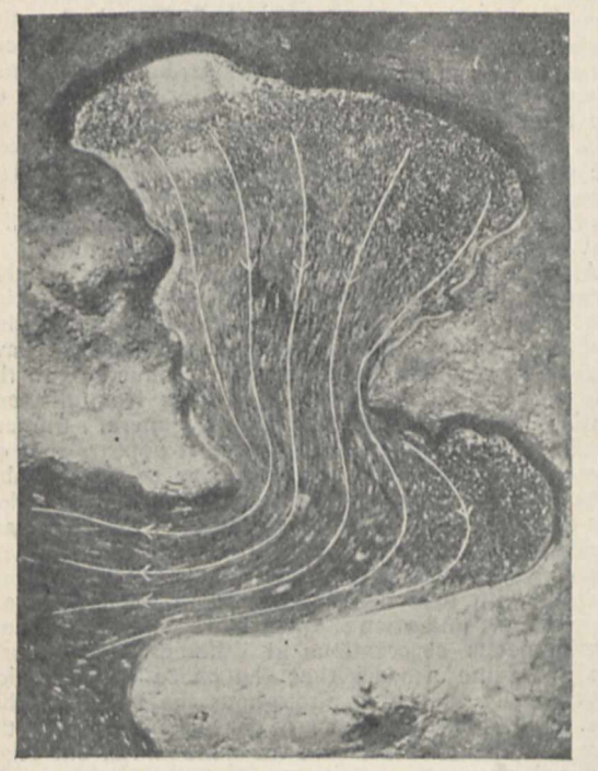
FIG. 1.-Model of Aomori Bay, showing stream lines of fundament l oscillation : period 4'453 in model, representing 303 m. in the bay itself.

vertical and a loop for horizontal motion, while the head is a loop for vertical and a node for horizontal