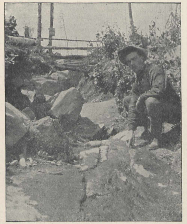
FIG. 2.-Metallic Outcrop of Silver Ore, Cobalt. From "Mines and Minerals of the British Empire."

Fig. 2. At surface, where the veins have been affected by atmospheric agencies, there is a high proportion of metallic silver. Much of the ore shipped in 1904 was largely composed of native silver. The discovery at Cobalt is an indication of Canada's bright prospects of becoming a more important mineralproducing country. In North America the territory controlled by Great Britain exceeds that of the United States. But of this immense area of 3,600,000 square