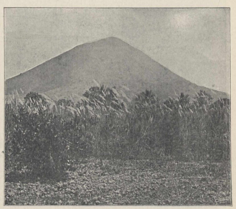
Fig. 1.—Clearing in the Strand-forest. To the left in the foreground Scaevola Koenigii; behind the grasses (Saccharum spontaneum) a group of coco-nut palms. South-east coast of Krakatau. From "The New Flora of the Volcanic Island of Krakatau."

It is to be regretted that more than ten years elapsed before the second exploration of the new Krakatau in March 1897. The number of species was then much increased, and amounted to fifty-three seed-plants and twelve vascular cryptogams; the ground was, in some cases, completely covered, ground was, in some cases, completely covered, and characteristic plant associations were forming; thus the Ipomoea Pes-caprae formation was a dominant feature on the beach. Further inland the vegetation constituted a kind of grass-steppe, the grass occasionally reaching a man's height and sometimes forming a thick jungle. On the hills and