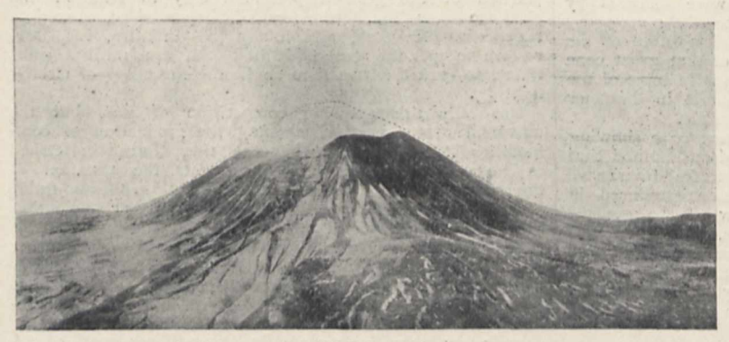
Fig. 1.—The aspect of the great cone of Vesuvius on May 4, 1906, as seen from the Punta del Nasone on M. Somma looking due south. The dotted line is that of the outline of Vesuvius in October, 1903, taken with the same camera and lens, and represents, except for a faint variation at the extreme summit, the actual outline of the cone before it was truncated by the late eruption.