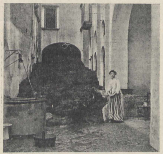
Fig. 3.—Lava that invaded the court of the villa of M, and T. Borosio at Boscotrecase.

The remarkable photographs of the great cone showing this truncation, compared with its original outline and that of the new crater at different dates, make impressive pictures. Plate V. of the memoir, here reproduced in Fig. 2, will remain as a classical view of the general shape of the cone with its scored sides, and Plate VI. of the details of those remarkable barrancos that are like the pleats in a half-opened umbrella. This scoring of the slopes of volcanoes was formerly supposed to be due to aqueous erosion, but is shown in this eruption to be caused by the slipping down of avalanches of loose