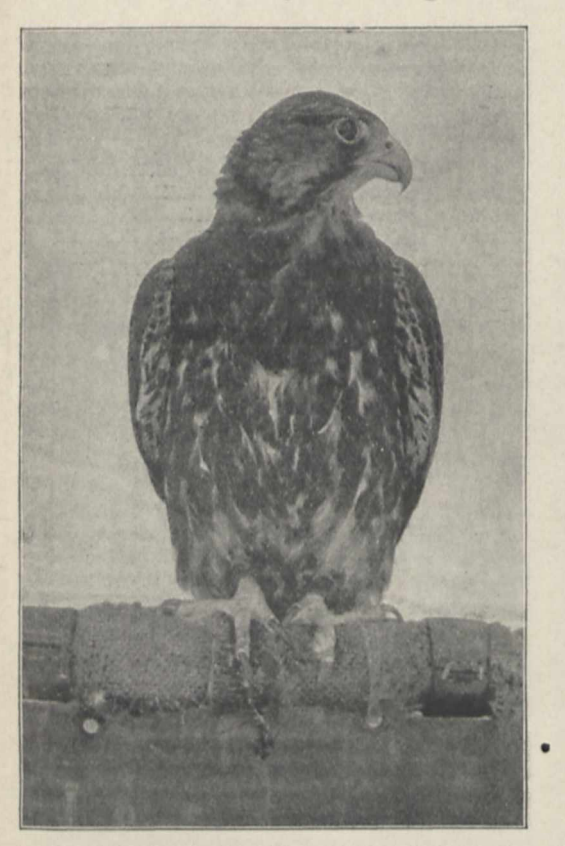
FIG. 2.—Young Passage Saker (Dark Variety). From "The Bāz-Nāma-yi-Nāsurī: a Persian Treatise on Falconry."

A valuable feature in the present translation is the number of footnotes which Col. Phillott has supplied, to explain and illustrate the Persian writer's meaning, to reconcile apparent discrepancies, or to confirm his statements from his own experience. To English readers interested in the literature of falconry, these footnotes will prove very instructive. The illustrations which accompany the text are of two kinds—reproductions of Persian drawings of hawking scenes, and