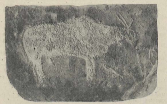
Fig. 2.-Rock-engraving of a buffalo. Size 60×40 cm.

and the human figure. The examples now described are superior in finish and artistic merit to those hitherto known. We have no longer mere lines or outlines produced by rough pointing or punching; the technique is more