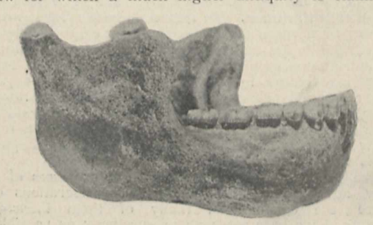
Fig. 1.-Mandible seen from the side.

THE oldest remains of Man with which, until now, we were acquainted date back to the middle Pleistocene, to the Moustier period. They are represented by the cave relics from Neanderthal, Spy, Krapina, Naulette, Malarnaud, and possibly Mentone, by the drift relics from Galley Hill and Bury St. Edmunds. In the memoir under notice, however, we have the description of the two halves of a lower jaw for which a much higher antiquity is claimed.