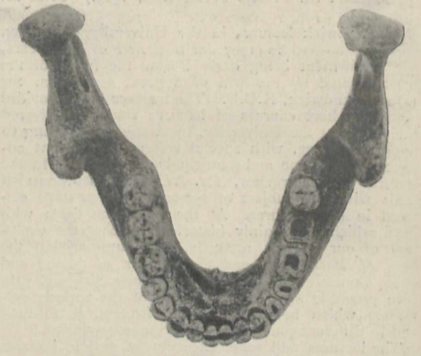
Fig. 2.-Mandible seen from above.

was October 21, 1907. When found, the two parts were thickly coated by the deposit in which they lay; the left half had a piece of limestone firmly cemented to it, both jaw and stone being similarly marked by dendritic deposits of iron and manganese. The sand in which the jaw