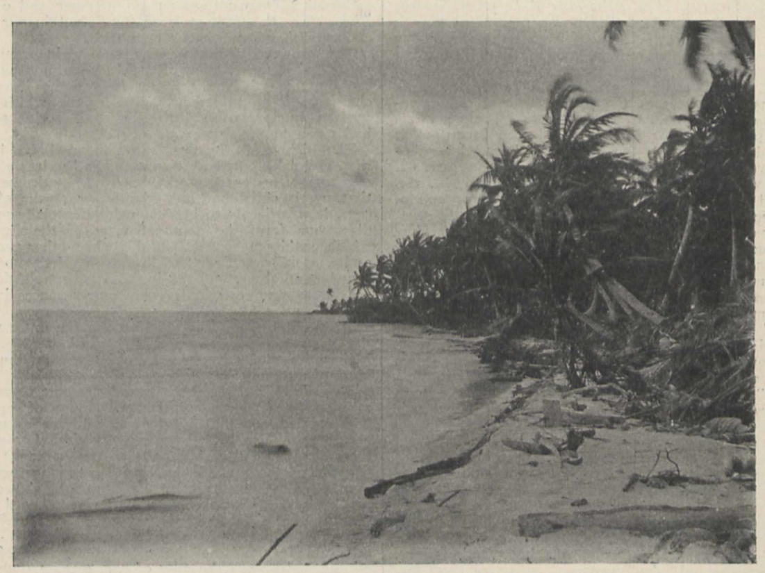
FIG. 1.-The Lagoon Shore of Pulu Tikus, to show the Sand-piling by a westerly wind. From "Coral and Atolls."

The statement that corals know "no natural death," does not rest on observation, and is contrary to the few facts we have. No zoologist would consider the rate of growth of corals slow. The observations on