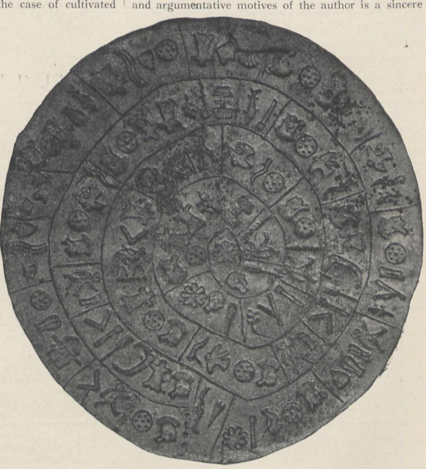
Face A. Fig. 1.—Disk, with Hieroglyphic Inscription, from Phæstos, From "The Dawn of Mediterranean Civilisation."

J UDGED by the declared aims of the author, who before his lamented death, was one of the brightest of Italian men of science, this is an eminently successful work. He is "convinced that it is worth while to excite the curiosity of those who are not archæologists," and he never forgets the average reader. He is equally convinced of the independence of Mediterranean civilisation, and he has undoubtedly made out a very strong case. The author's enthusiasm sometimes makes the reader unnecessarily suspicious, but added to the popularising and argumentative motives of the author is a sincere