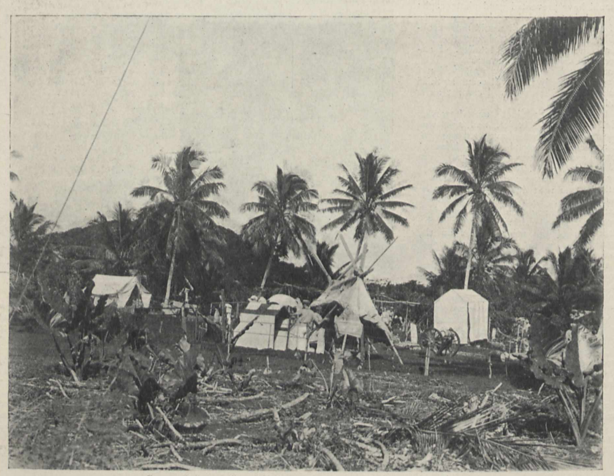
FIG. 3.—A General View of the Eclipse Camp. Camera facing nearly West. NO. 2173, VOL. 86