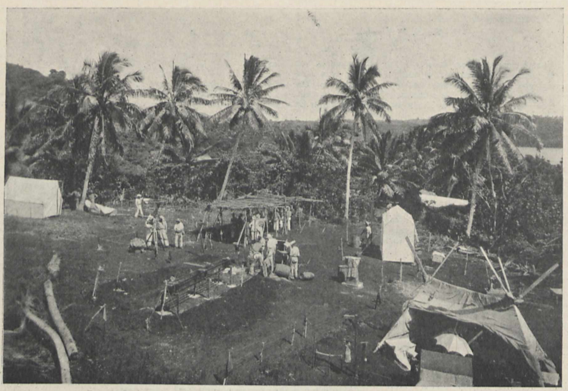
FIG. 2.-In the early stages of the erection of the Instruments. View taken from a Cocoanut Tree.