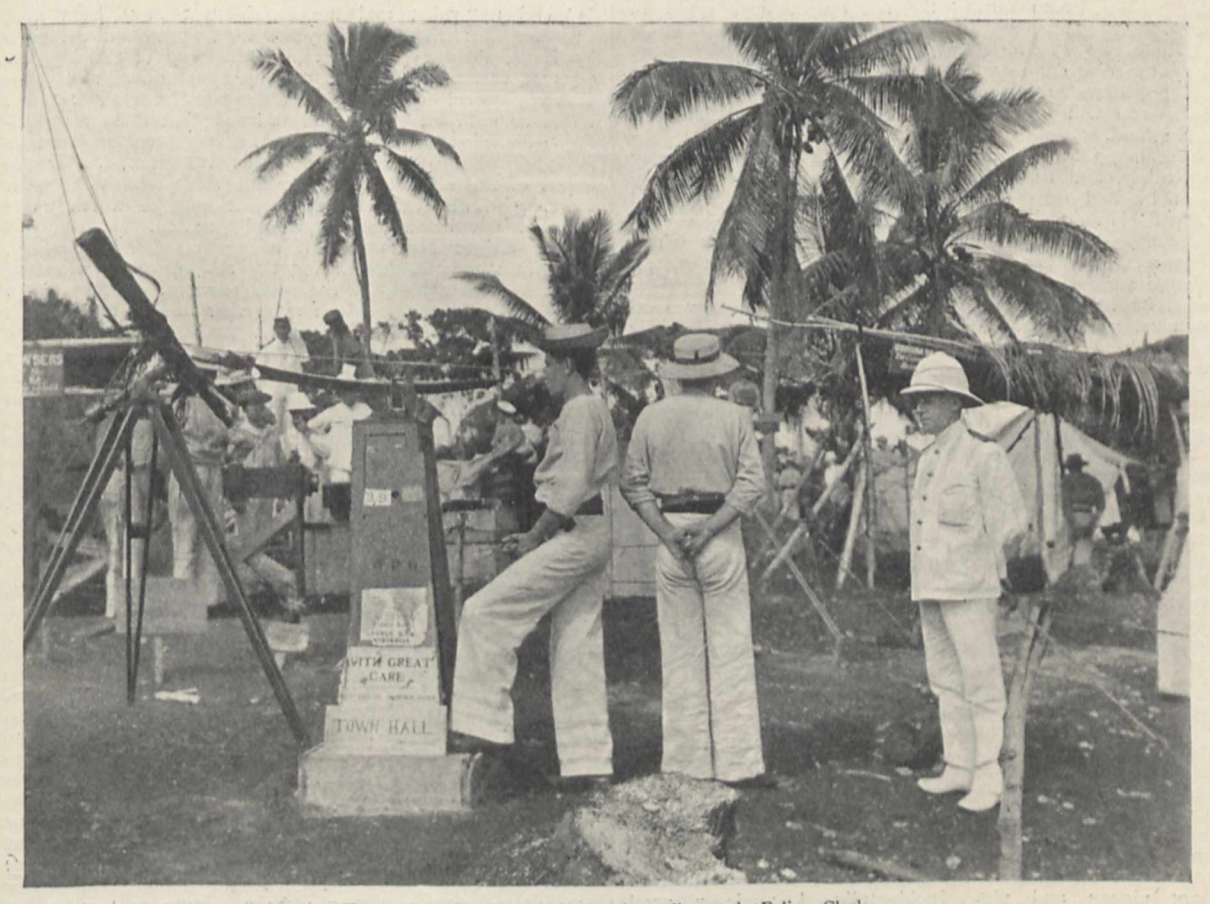
FIG. 4.-The Captain and his two time callers at the Eclipse Clock.