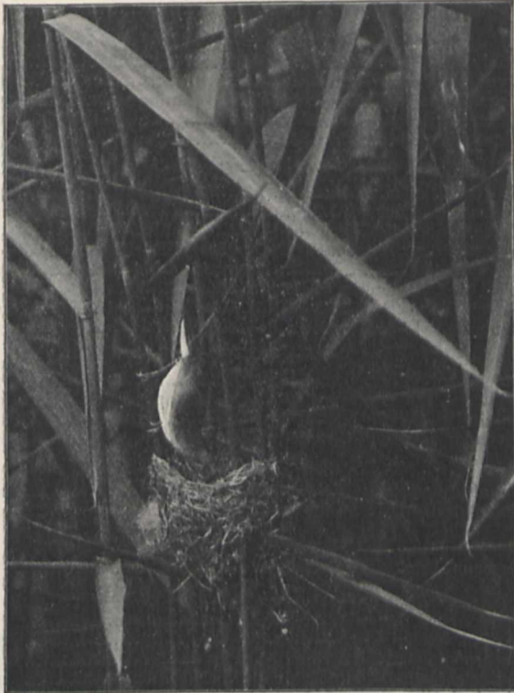
FIG. 2.—Reed-warbler feeding its young. From "The British Bird Book."

Mr. A. W. Seaby's pictures are as charming,