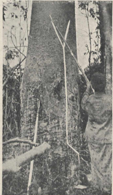
FIG. 1.—Jelutong Tree, showing improved method of tapping. From "Rubber."

THE Rubber and Allied Trades Exhibition and the International Rubber Congress, held conjointly and recently concluded, are doubtless responsible for the simultaneous appearance of four books on rubber. One of these is a welcome attempt, as its title implies, to cover the whole range of the subject, and