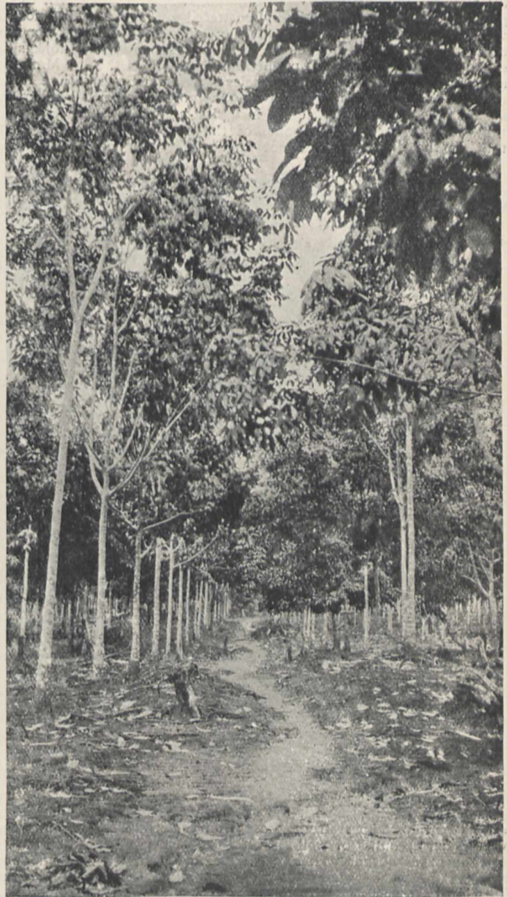
FIG. 2.—Three-year-old rubber trees. From "Rubber."

forget that the sources of rubber are many and various. Trees, vines, shrubs, tubers, rhizomes, &c., belonging botanically to different classes of plants and growing in different continents, all appear in the list of productions of this commodity. This being so, and without implying that the book under review would have been more successful in any other form, it is