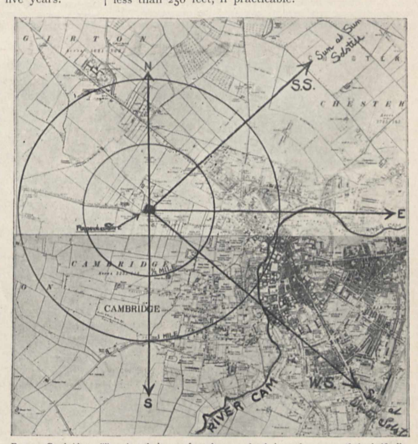
Fig. 1.—Cambridge. The selected site, 70 feet above sea-level, is at the centre of the half-mile and mile circles, and lies 45 feet above the river flats to the eastward. The lines SS and WS represent the directions of sunrise at the summer and winter solstices respectively. Solar observations, which have to be made soon after sunrise, must therefore be made through smoky and misty atmosphere due to the town and river valley respectively.

"The observatory should be at an elevation of not less than 250 feet, if practicable."