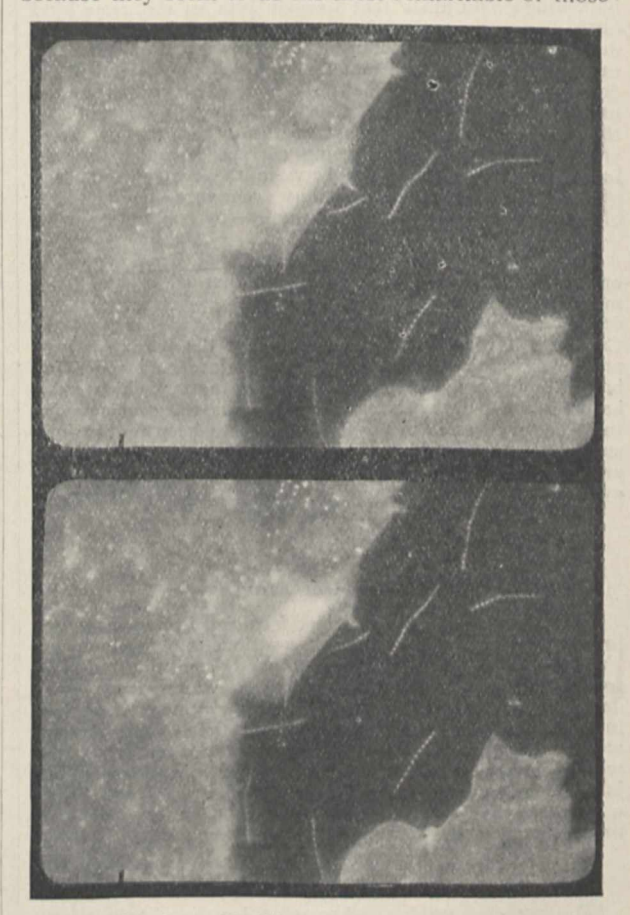
FIG. 6.-Spirochæta of Syphilis (from the cornea of the eye) enlarged.

parations which Messrs. Pathé Frères have exhibited, because they seem to us the most remarkable of those