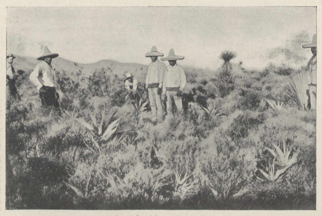
FIG. 2.-Guayule in a very dense growth.

The book is evidence of a vast amount of labour undertaken in the spirit of enthusiasm, but its utility for the general reader is curtailed by the want of condensation in dealing with experiments and tabular results, and the absence of definite statements or deductive conclusions. It is elaborately illustrated by photo-litho plates, containing a large number of photo-