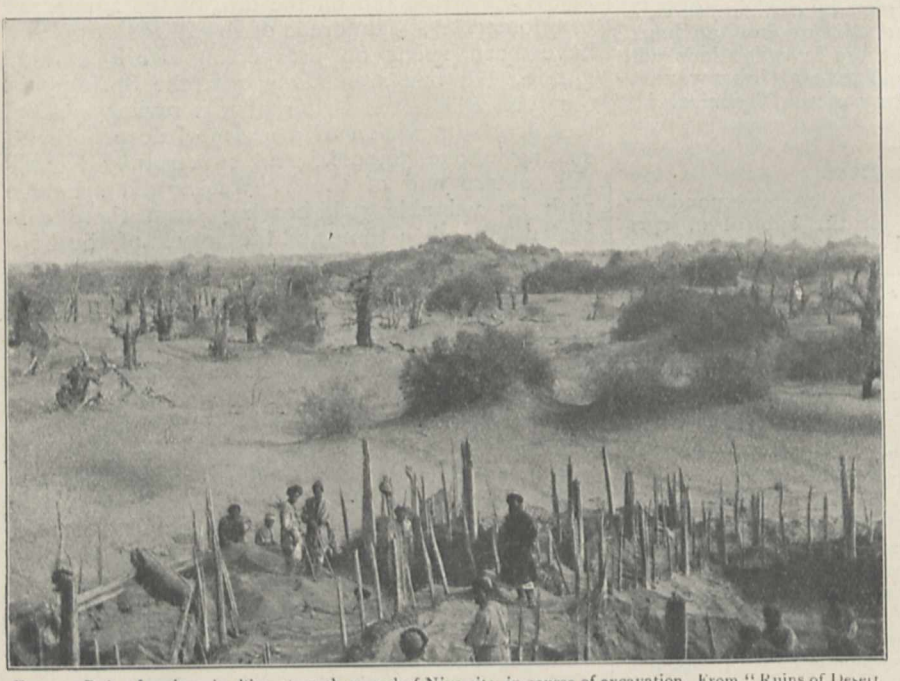
Fig. 1.—Ruin of ancient dwelling at southern end of Niya site, in course of excavation. From "Ruins of Desert Cathay."

Of the several thousands of ancient MSS. and