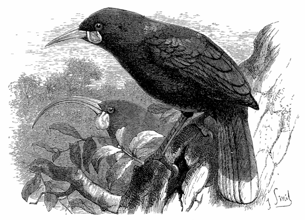
THE HUIA BIRD (Heteralocha gouldi)

2. A Sooty Crow-Shrike ( Strepera fuliginosa ), purchased on the same day, is one of a peculiar group of Australian birds, of which the Society previously possessed examples belonging to two other species. These are all placed in the cages outside the "Parrot-house," which are devoted to the reception of the hardy species of crows ( Corvida ) and their allies, and at the present moment contain examples of several other species of great interest, such as the yellow-billed chough of the Alps ( Pyrrhocorax