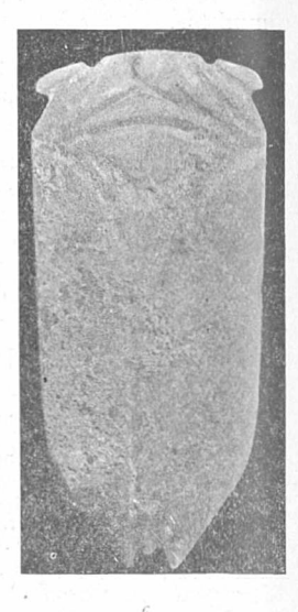
Fig. 1.—a, Plain type of tongue-amulet; b, tongue-amulet carved in shape of realistic cicada—upper face; c, tongue-amulet showing conventionalised form of cicada. From "Jade: A Study in Chinese Archæology and Religion."

ings serving their worship were nothing but the real images of these deities under which they were worshipped. Anthropomorphic conceptions are lacking in the oldest notions of Chinese religion, and therefore no anthropomorphic images are known. The shapes of these images are geometric in design: a jade disk, round and perforated, representing heaven, a tube surrounded by a cube earth, a semicircular disk the north, &c.