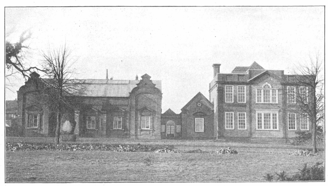
The new wing (on the right) adjoining the old one-storey building of the Rothamsted Experiment Station.

that farmers had evolved an admirable system of agriculture, but pointed out that every industry benefited