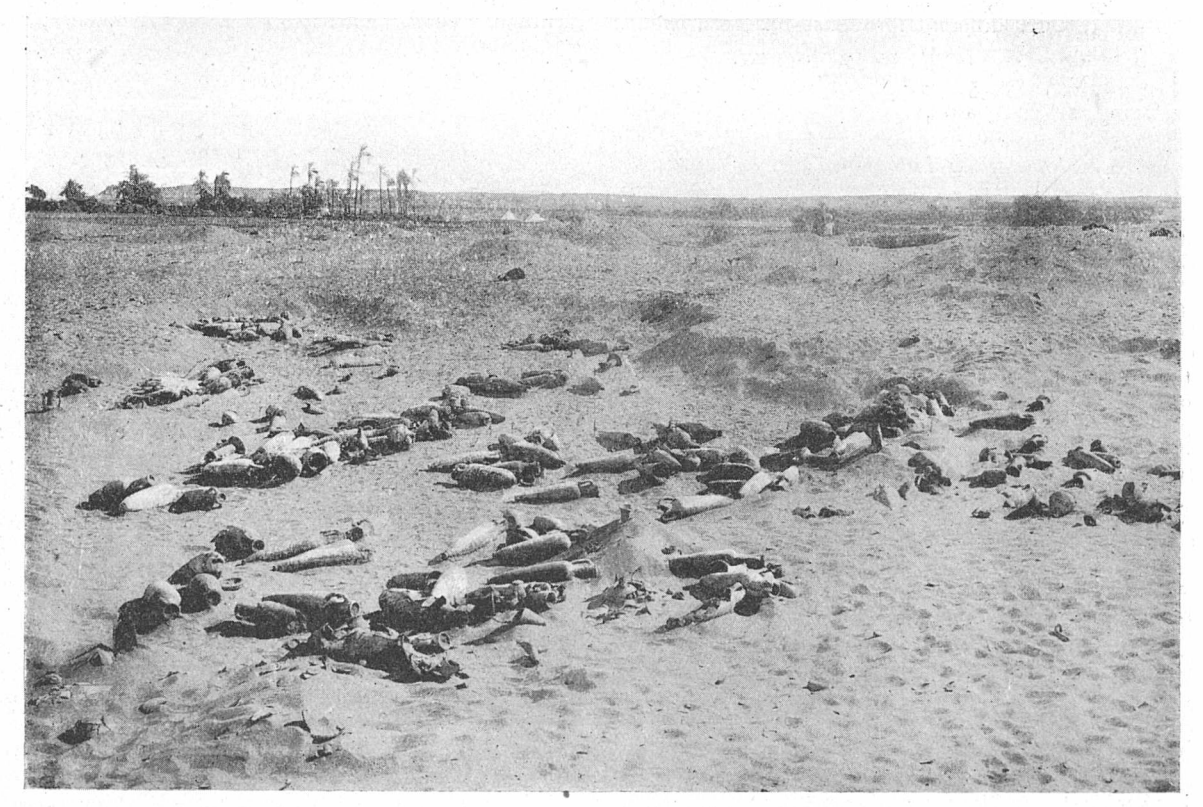
FIG. 1.-Pottery deposit near Canteen or Customs House, Romano-Nubian period. From "The Archaeological Survey of Nubia."

Predynastic Egyptians formed one of these groups and the Middle Nubians another; but there was a buffer-population, the "B-group" of the archæolo-