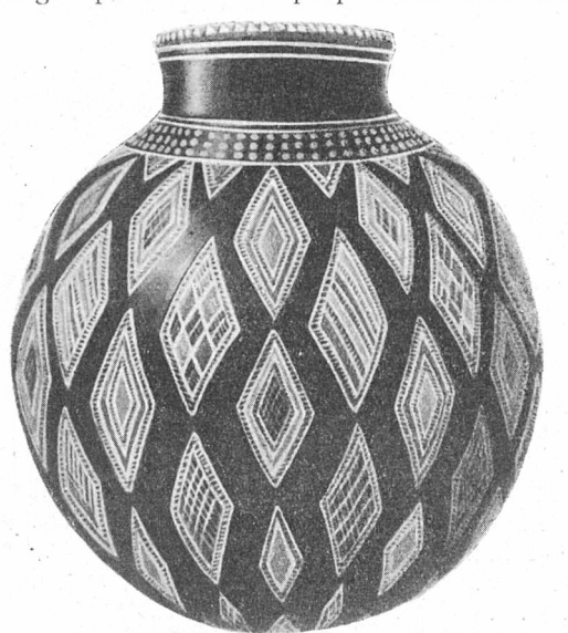
FIG. 2.—Later C-group period. Large jar of black polished ware with incised and coloured patterns in imitation of basket-work. Cemetery 101, grave 38. Scale 1:6. From "The Archaeological Survey of Nubia."

these people "Libyan." In prehistoric times there were groups of kindred peoples scattered along