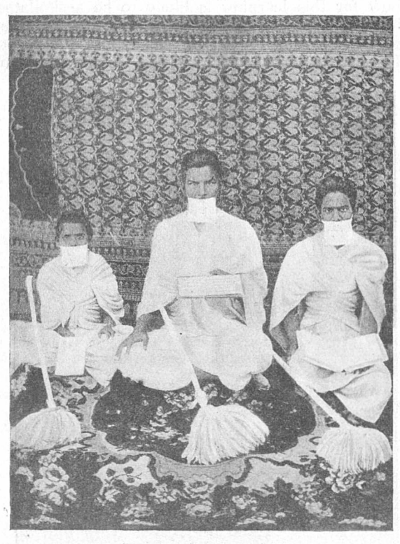
Fig. 2.—Jain Ascetics with cloth before mouth and sweeping brush.

Much space might have been saved by compression. If, for instance, a set of standard accounts of birth, marriage, and death observances were once for all prepared, it would save constant repetition, and it would be necessary only to refer to variations from the normal practice. But the author has followed here the example of other writers in the series. When these monographs come to be revised, the scheme of arrangement might with advantage be reconsidered.