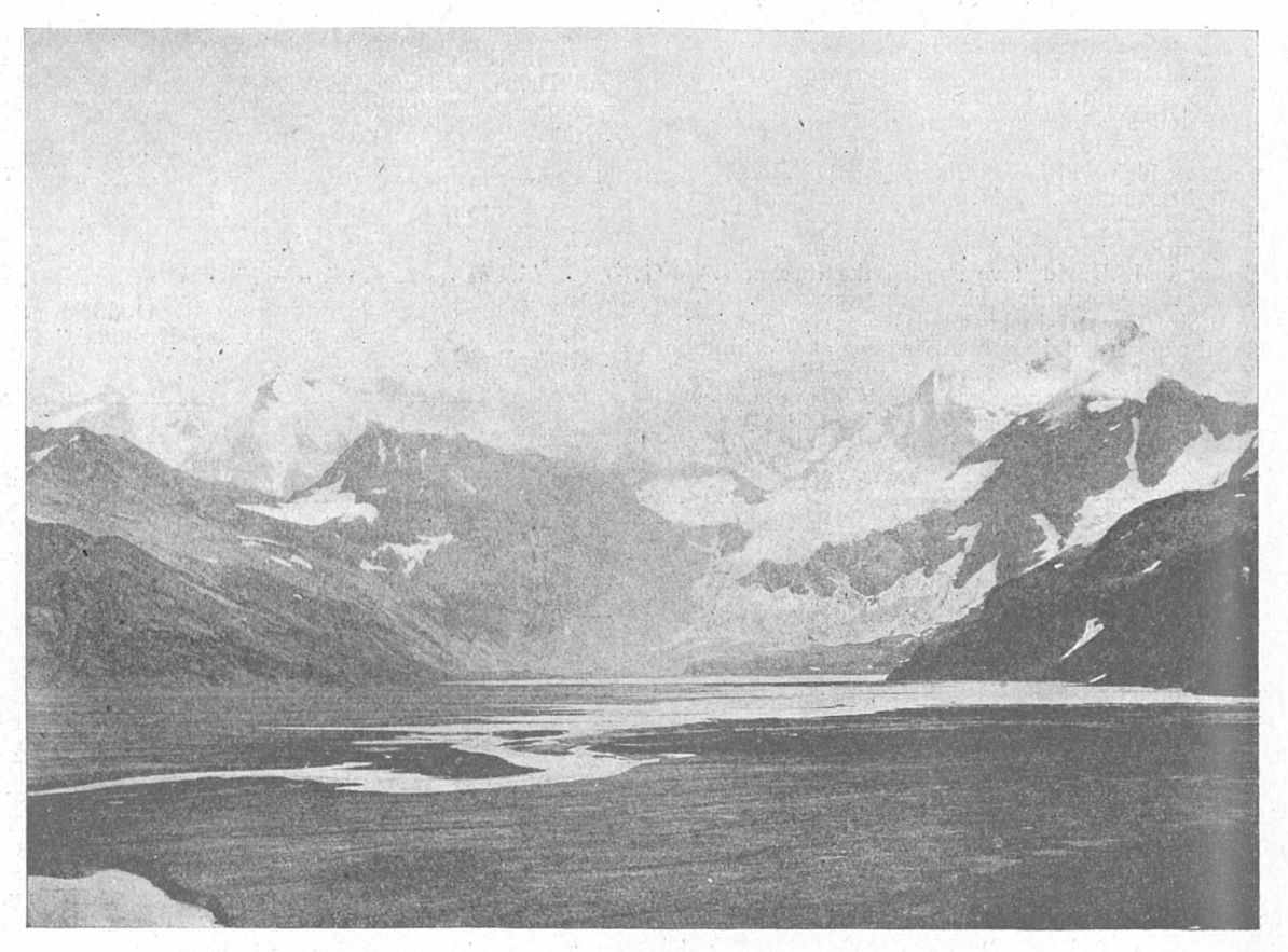
FIG. 1.-Moraine Flat, glacier, small loch and stream, Cumberland Bay. From the Trans. Roy. Soc. Edinburgh.

South Georgia offers the best opportunities of deciding between Suess's theory and the alternative view that South Georgia and the Falklands are parts of an