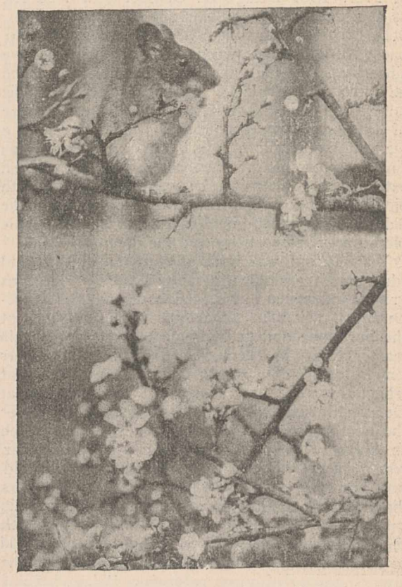
FtG. 2.—The long-tailed field-mouse. From "Wild Creatures of Garden and Hedgerow."