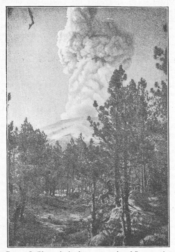
FIG. 1.-Cauliflower clouds of a steam eruption of Popocatapetl, October 12, 1920. From the American Journal of Science, January, 1921.

made by him in October last (Amer. Journ. Sci., vol. cci., p. 81, 1921). Considerable outbursts of steam were then taking place from the crater, accompanied by a small quantity of stones and ashes, and