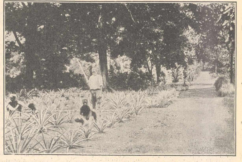
FIG. 2.-Pineapple plantation in the Victoria Botanic Gardens on the east side of the Limbe river.

The perusal of the narrative under review strengthens the conviction which we formed on reading His Excellency's address, that "it would be a lasting discredit" were we "to neglect to repair the damage" which the gardens have