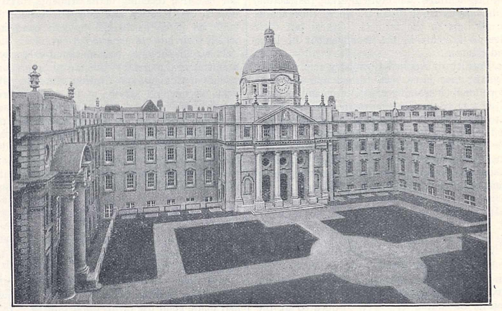
FIG. 1.-Royal College of Science for Ireland.

The work of the College is organised in three faculties-those of agriculture, applied chemistry, and