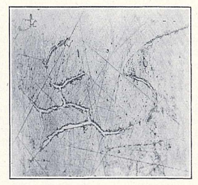
FIG. 1.—Cementite network in mild steel. × 300.

WITH reference to the particularly interesting article by H. C. H. C. in NATURE of November 17, p. 728, might I mention the following amongst many other examples which have come under my notice illustrating the tendency of cementite to form cell walls or a network under conditions where the occurrence of pearlite is more commonly anticipated? In