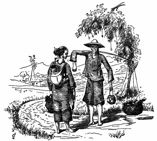
CHINESE MAN AND WOMAN

that God's works are even more wonderful than we always believed them to be? As for the theory being impossible, who are we that we should limit the power of God? If it be said that natural selection is too simple a cause to pro-