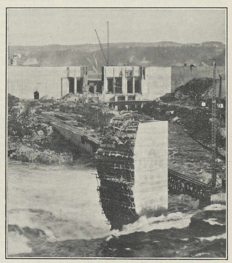
FIG. 1.—The 'obelisk ' for damming the main stream of the Saguenay River in course of construction.

The distribution of energy among the provinces is, as might be expected, far from uniform. Quebec and Ontario, industrial regions of high productivity, possessing no natural deposits of coal within their borders, make by far the largest demands for