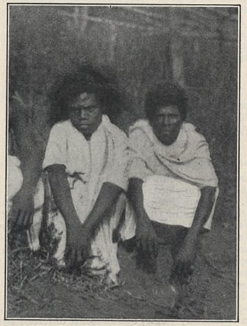
FIG. 1.-Two Kadar men from the Cochin Hills.

people are not unlike the other jungle tribes of southern India, having a head of hair varying from wavy to curly, but in the extreme interior of the hills I was fortunate enough to find five men and one woman with undoubtedly spirally curved hair, one of whom was pure woolly with short spirals, and the rest were of the frizzy type, similar to that seen among the Melanesians. Besides their spirally curved hair, the Kadars are short (average stature, 1516 mm.), of very dark complexion (the skin colour varying from 29 to 33 in von Luschan's scale), prognathic, and have not infrequently receding foreheads. I was informed by Mr. K. Govinda Menon, Conservator of Forests of the Cochin State, and one who has known the Kadars very intimately for the last quarter of a century, that in the early years of his service he noticed at least a dozen men and women with woolly and frizzy hair, but who must have died out since.