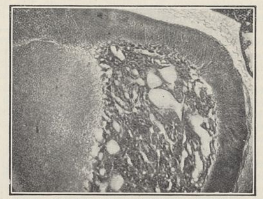
FIG. 1. Section through adrenal of female of Trichosurus wulpecula showing hypertrophied zone extending into the medulla.

At early pregnancy, there is a slight decrease in the size of the 'delta' zone (compared with the size of the gland) but the 'beta' zone (also compared with the size of the gland) remains the same. At midpregnancy the 'beta' zone has nearly doubled its breadth and the 'delta' zone has increased considerably. At late pregnancy the 'beta' zone has grown until it occupies more than three quarters of the hypertrophied area. In a female in which a recent parturition had occurred, half the 'beta' zone had been transformed into 'delta' zone cells again. In a female suckling a small pouch young, the 'delta'