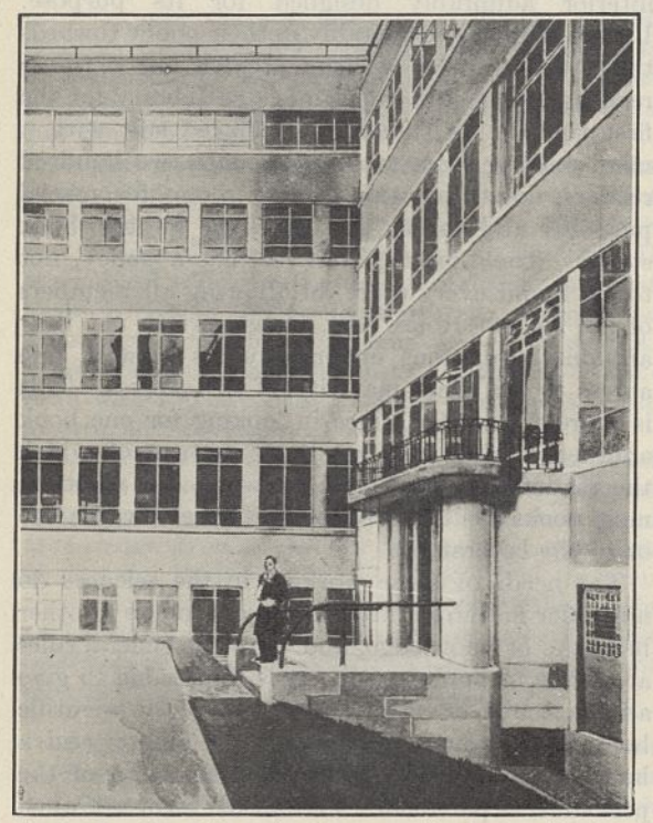
FIG. 1. Drawing of the north-east corner of the Zoology Court with the main entrance.

Science has its rarities in the book world, not equal in fame to Caxtons or folio Shakespeares, but of these the University Library has its fair share. The scientific worker is usually concerned with the more modern book and with the facility