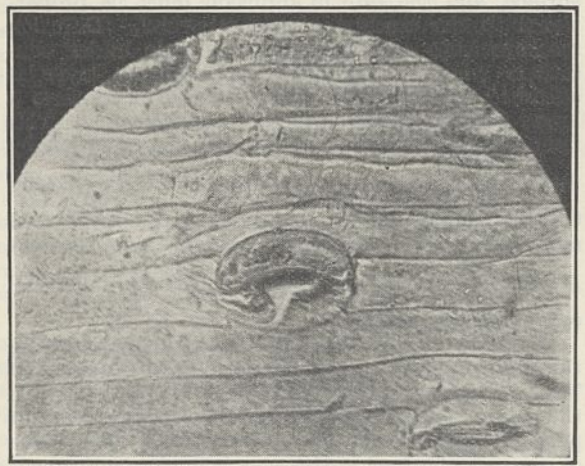
Fig. 1. Burst guard-cell after exposure to polarised sunlight.

AT a meeting of the Biochemical Society in November 1925, I read a paper on the "Hydrolysis of Starch in the Guard-Cells of the Leaf by Polarized Light". This work has since been amplified and confirmed, and some of the results were shown at a meeting of the Linnean Society in April 1933.