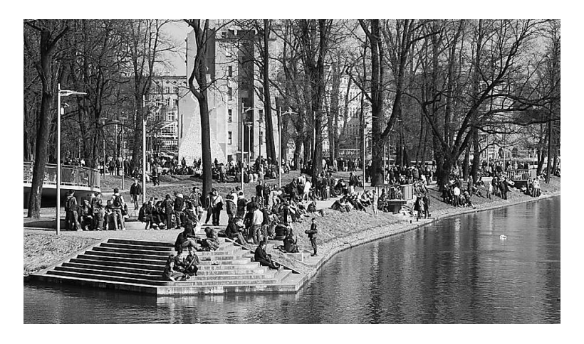
Figure 3. "Students" Slodowa Isle