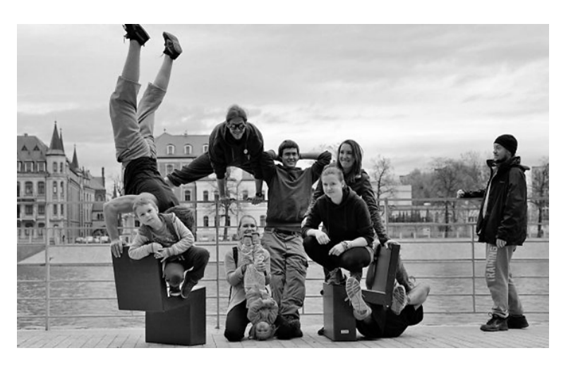
Figure 4. Official opening of the Dunikowski Boulevard

In July 2016, the author conducted an internet survey among the young inhabitants of Wroclaw which were randomly selected. Out of 80 respondents, 96.3% were people between 19 and 30 years of age, 2.5% between 31 and 40 and one person aged between 41 to 50. The surveyed were asked to mark on a scale from 1 to 5 the river Odra's importance to them. Over 57% of them marked either 4 or 5 on the