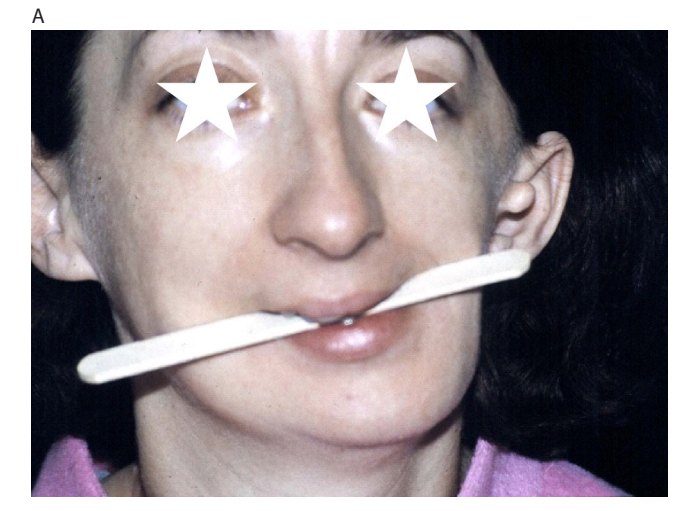
Fig. 1. Facial asymmetry before (A) and after multiple osteotomy followed by dermal grafting (B) \,