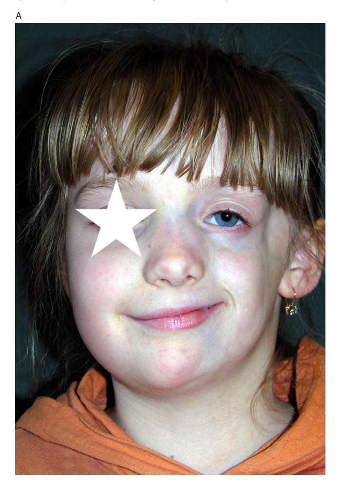
Fig. 4. Aggravation of bone and soft tissue hypoplasia in Parry-Romberg syndrome (photos taken at the ages of 6, 9 and 15 years)