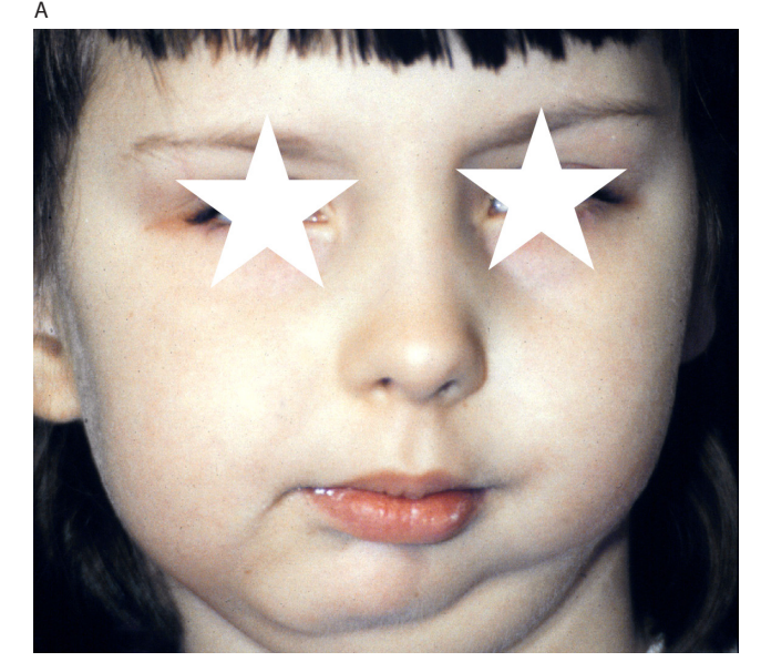
Fig. 7. Unilateral temporomandibular joint ankylosis (TMJA) before treatment (A); schematic representation of mandibular deformity, post-excision defect, and normal mandible restoration (B). The result of treatment with the use of costochodral graft and application of external distractor, according to our own method (C)

TMJA treatment consists of 2 parts. The most important is a complete resection of ankylosis, which, in severe forms involving the base of the skull, is very difficult and dangerous. After gap arthroplasty, an even greater shortening of the mandibular ramus arises, which calls for spacers to also act as separators. Although the use of silicone blocks or other materials can improve facial symmetry