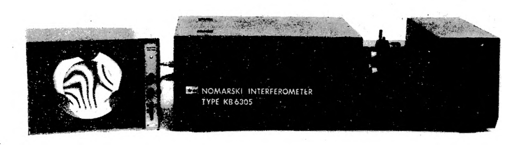
Fig. 2. Nomarski interferometer (COBRABID made)

The set of instruments shown at the exhibition became a significant supplement to the EOC'83 programme giving a short review of possibilities of the Polish scientific and industrial centres.