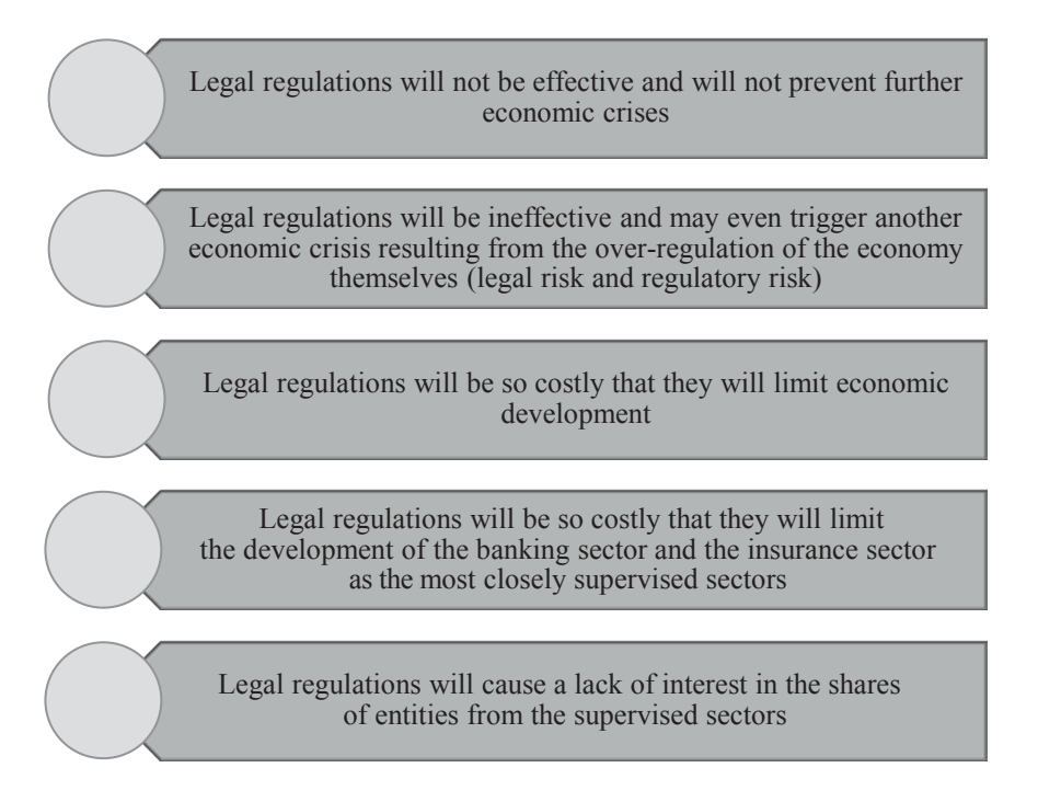
Fig. 3. Potential dangers of regulatory overactivity

On the other hand, this study has exposed the over-regulation effect as one of the reasons for companies to leave the stock exchange market. Excessive regulation means for companies not only costs but also a serious legal risk in the form of restrictions and sanctions. One can even define this problem as creating legal barriers to entering the market and functioning in it. If so, then there is the phenomenon of capital market inversion. Access to the capital market was to facilitate business activity, but it became a hindrance to it instead (Figure 3).