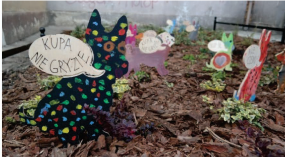
Figure 8. "Talking dogs" – preparation and finished work