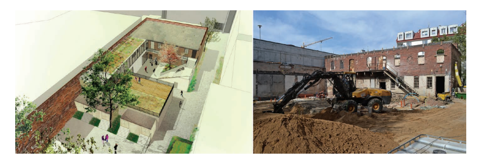
Figure 4. Local Activity Center, Prądzyńskiego 39a. Project and work progress 21/09/2018

One of these projects is the Local Activity Center in Prądzyński Street. The completion of the revitalization of the yard, which additionally introduces the active involvement of the residents, is to end in the autumn of 2019. Work on the investment has already begun.