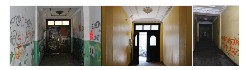
Figure 2. The entrance gate of the building at Wieckowskiego 21 (2014, 2015 and 2018)