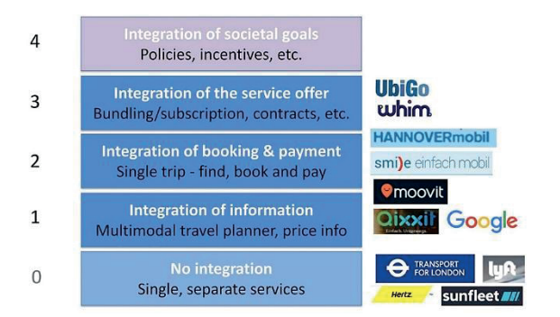
Fig. 1. Topology of Mobility-as-a-Service including levels and examples

Kamargianni et al. [2016] classified MaaS systems regarding different integration levels: 1) partial integration (partially integrated ticket, payment, and ICT); (2) advanced integration (completely integrated ticket, payment, and ICT); and (3) advanced integration with mobility packages. Sochor et al. (2018) developed a typo-logy of MaaS schemes distinguishing four integration levels and a basic level without integration (Figure 1).