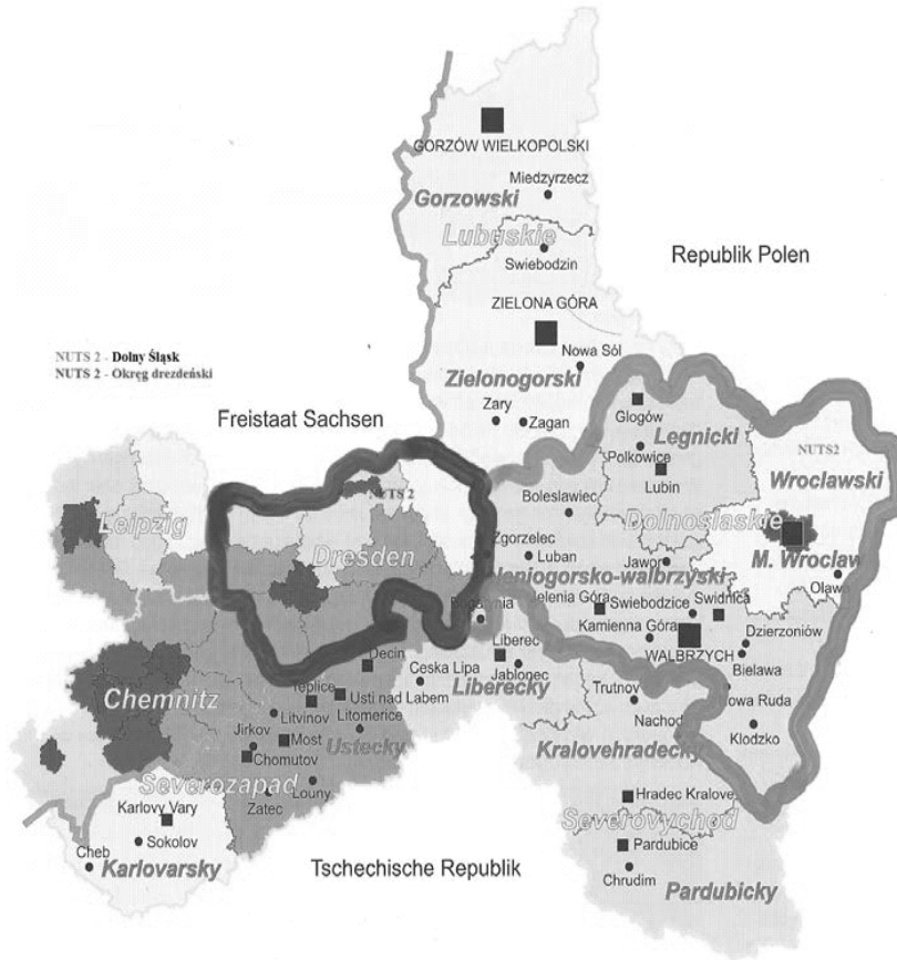
Figure 1. Spatial arrangement of Lower Silesia and Dresden district

European regions may take the form of an along-the-border cooperation of a cross-border one. Therefore, the latter does not refer exclusively to these local entities (e.g. communes) which are adjacent to each other on both sides of the border, including regions [Pietrzyk 2000, pp. 166–196].