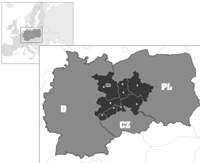
Figure 2. Region “3-CIP” in Europe

After a few years of its functioning it was, however, decided that it replicated some forms of borderline and cross-border activities and therefore the decision was taken to wind it up. A more detailed discussion regarding this cooperation platform, in the period of 2006–2011, does not constitute the subject matter of this study.